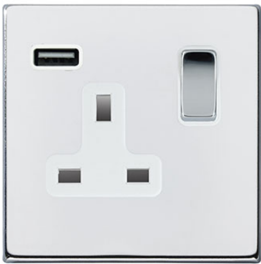
Wiring 13Amp Switched Single Sockets with USB Charging Outlet — Neutral — Earth — Live