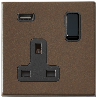
Wiring 13Amp Switched Single Sockets with USB Charging Outlet — Neutral — Earth — Live